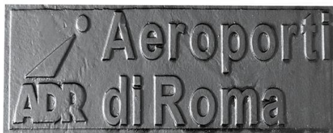
Special Badging if required