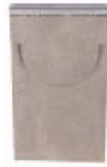
Closing End Cap