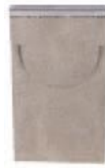
Closing End Cap