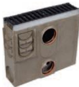
Sump Unit 500mm