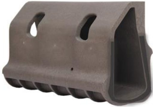
60000 – Duradrain - Full Batter/45 Degree Splay